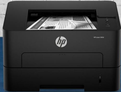
HP Laser 303dw