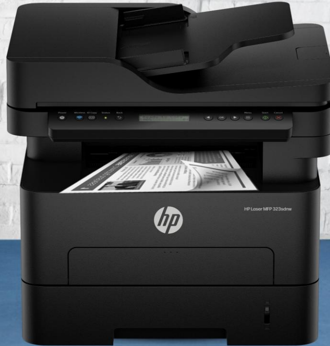
HP Laser MFP 323sdnw