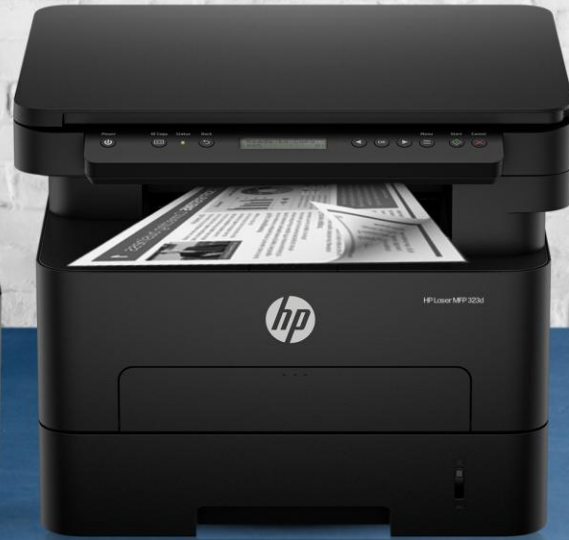
HP Laser MFP 323dnw